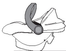
Incorrect In-Vehicle Position

The following illustrations demonstrate the correct and incorrect in-vehicle installations.